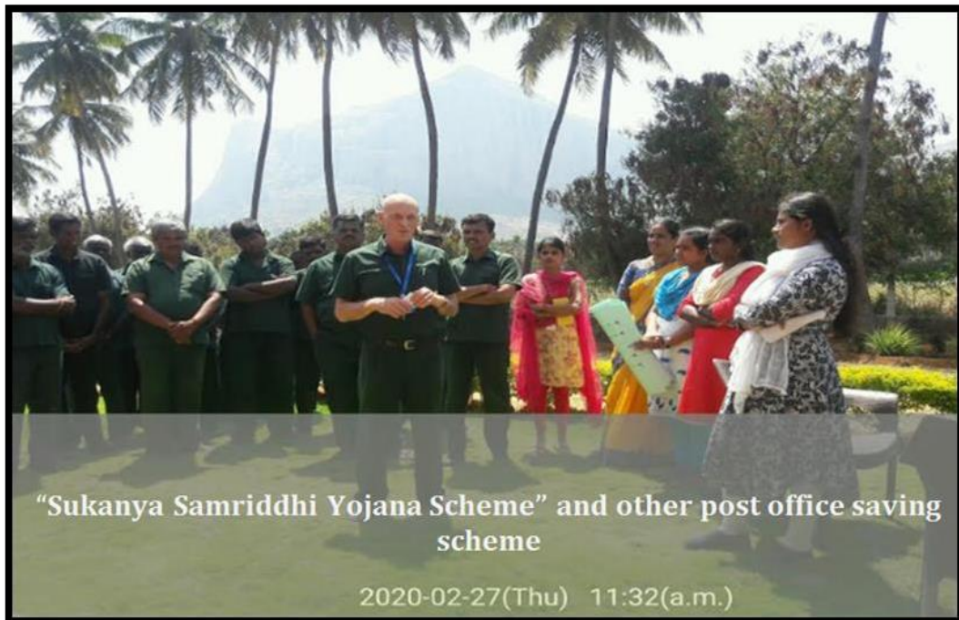
“Sukanya Samridhhi Yojana Scheme” and other post office saving scheme