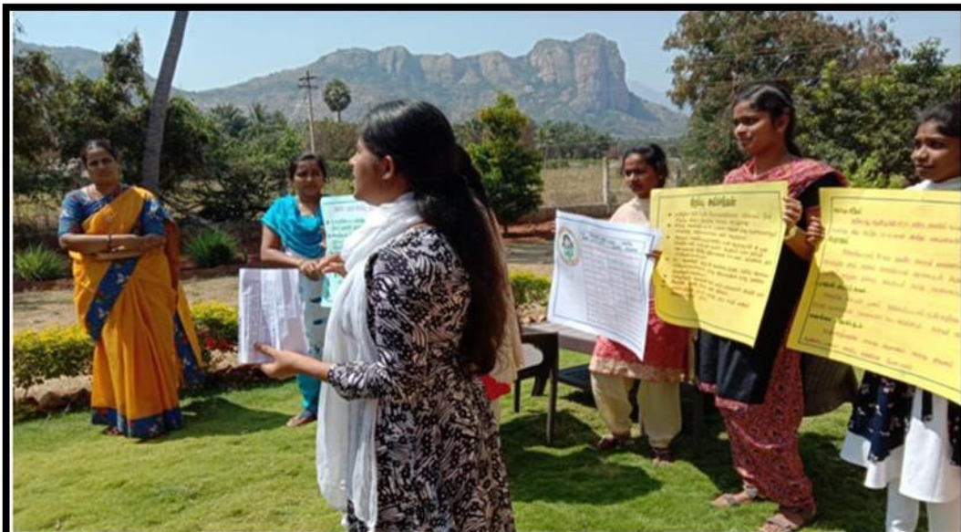
“Sukanya Samridhhi Yojana Scheme” and other post office saving scheme Date: 27.02.2020